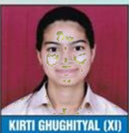
AIR - 15