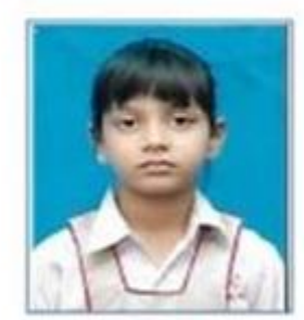
ALYONA CLASS II INTERNATIONAL RANK-1 INTERNATIONAL RANK-1