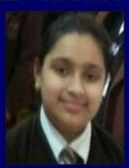
GURNOOR CLASS VI