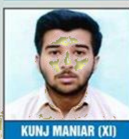
AIR - 50